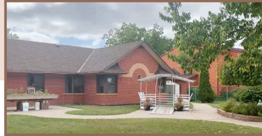
Foyer Richelieu in Welland

Everyone deserves high quality compassionate care, especially throughout an illness and at end of life. Hospice Niagara has embarked on an ambitious $18-million capital campaign to add 20 new hospice beds and two new Hospice Centres of Excellence in Niagara by the end of 2024, in addition to the existing 10 beds in St. Catharines. The new hospices will be located alongside long-term care facilities, Foyer Richelieu in Welland and Gilmore Lodge in Fort Erie. Our region currently lacks adequate hospice services to ensure people receive the care they need, expect and deserve. Together with the community's support, we can ensure that hospice care is available when needed, for generations to come. For more information, please contact campaign@hospiceniagara.ca or 905-984-8766 ext. 224.