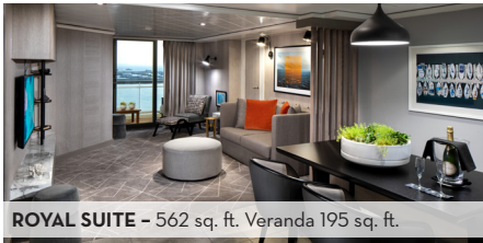
ROYAL SUITE – 562 sq. ft. Veranda 195 sq. ft.