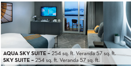
AQUA SKY SUITE – 254 sq. ft. Veranda 57 sq. ft. SKY SUITE – 254 sq. ft. Veranda 57 sq. ft.