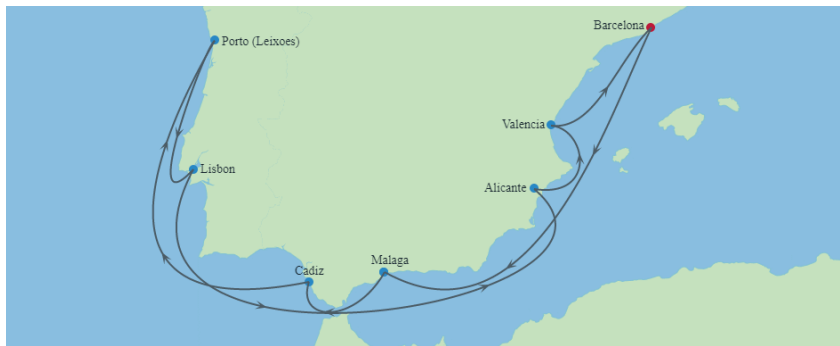
10-NIGHTS BEST OF SPAIN & PORTUGAL