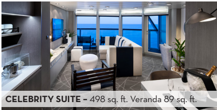
CELEBRITY SUITE – 498 sq. ft. Veranda 89 sq. ft.