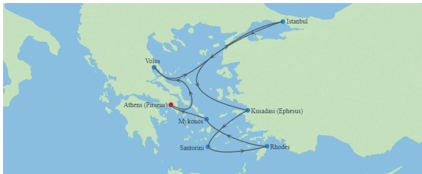
10-NIGHTS GREECE & TURKEY