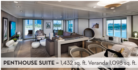
PENTHOUSE SUITE – 1,432 sq. ft. Veranda 1,098 sq. ft.