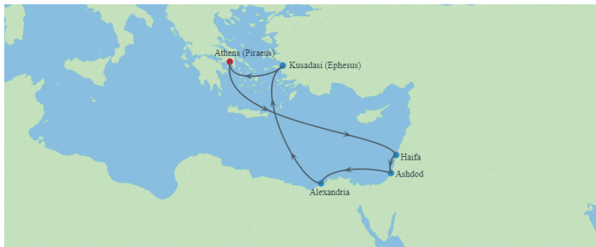
11-NIGHTS EGYPT & ISRAEL