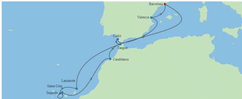
12-NIGHTS CANARIES, MOROCCO, SPAIN HOLIDAY